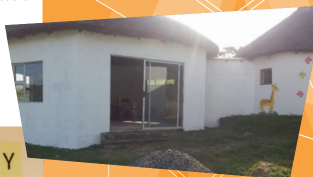
Above: The new rondavel at Ncinci One's