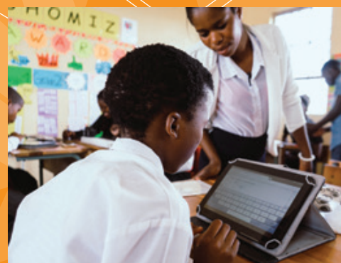
Above and left: Learners from Xhora Mouth J.S.S