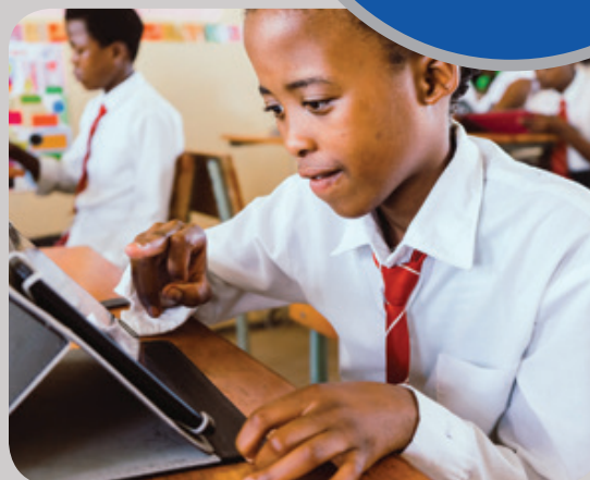
Above: Learner from the iiTablet Tshomiz programme at Bulungula

*The above is based on unaudited figures.