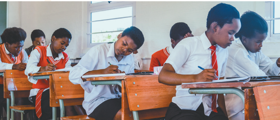
Above: Bulungula Programme Implementation Summary