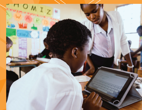
Above and left: Learners from Xhora Mouth J.S.S

"This programme is very good for the kids. When I was at school, I didn't get the chance to learn English. It was only in High School. I could read before but I couldn't understand. I would just memorise without really understanding."