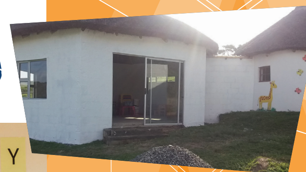
Above: The new rondavel at Ncinci One's